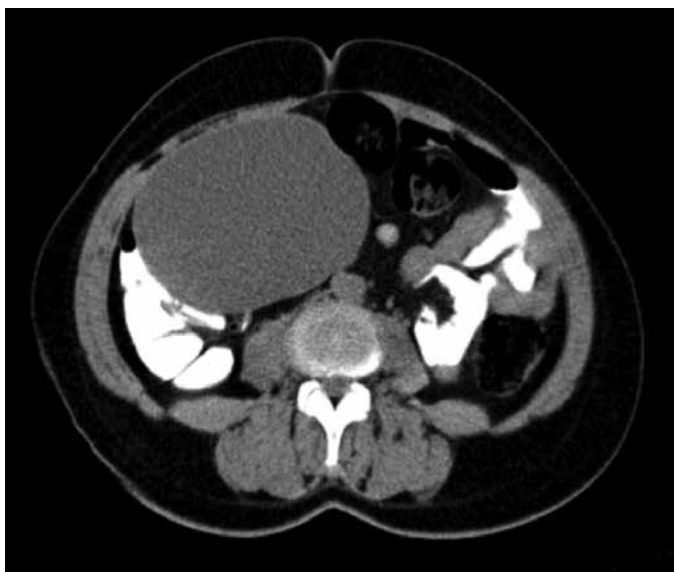
Figure 1. Axial CT images before IV contrast demonstrate the homogeneous giant cystic mass which take origin from the right adnexa